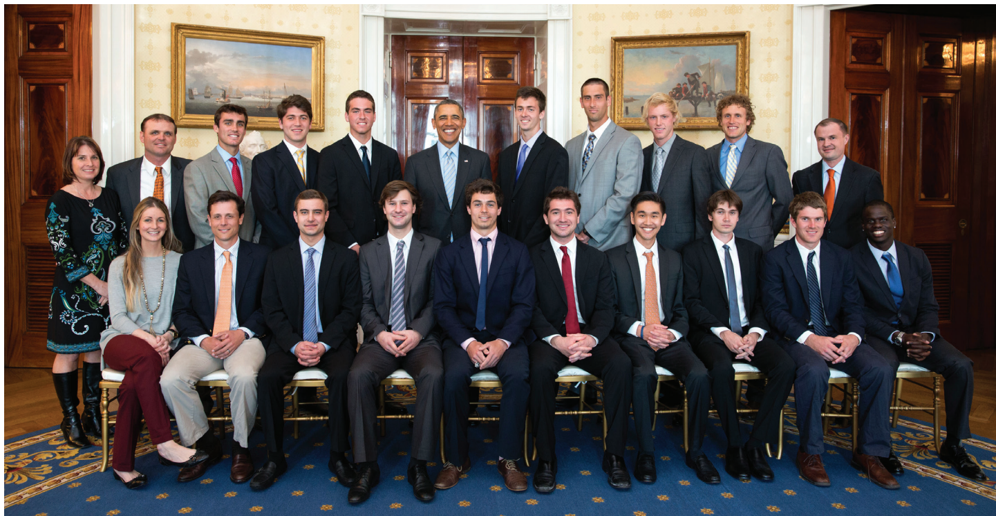
2013 Team (top); 2017 Team (Bottom)