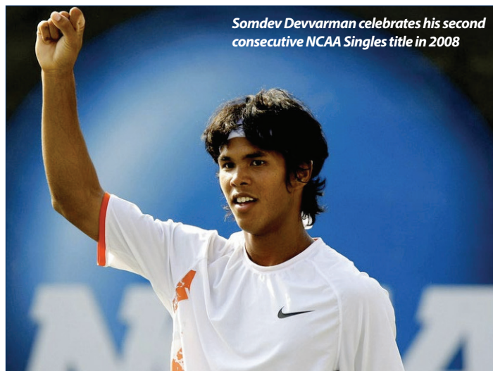
Somdev Devvarman celebrates his second consecutive NCAA Singles title in 2008